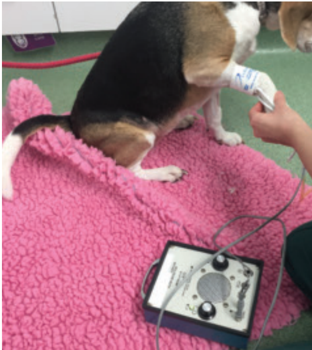
Figure 3: Non-invasive blood pressure with Doppler machine.

Blood tests may also help in ruling in or out a functional tumour of the adrenal cortex (hyperadrenocorticism). It is important to note that the suspicion or confirmation of hyperadrenocorticism does not rule out the presence of a concomitant pheochromocytoma. A functional cortical adrenal tumour should be confirmed with a low dose dexamethasone suppression test.